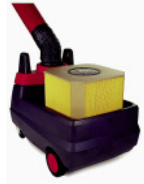
LongLife® Filter inside of unit